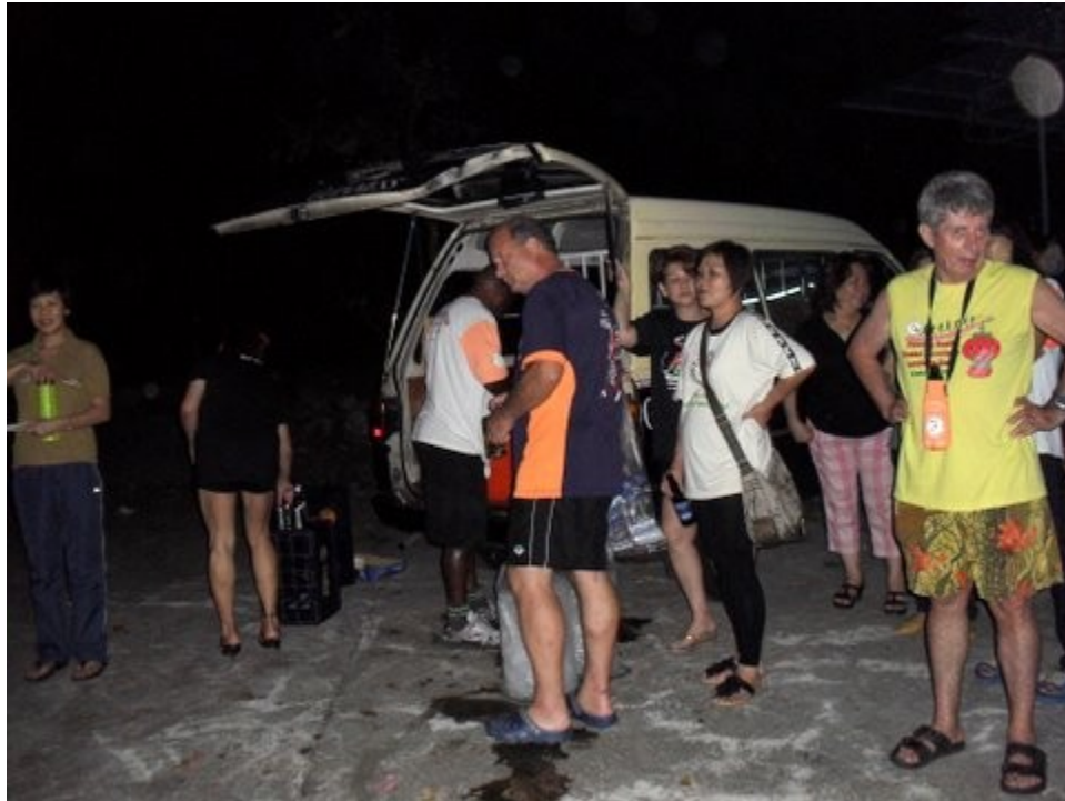
Getting ready for the circle