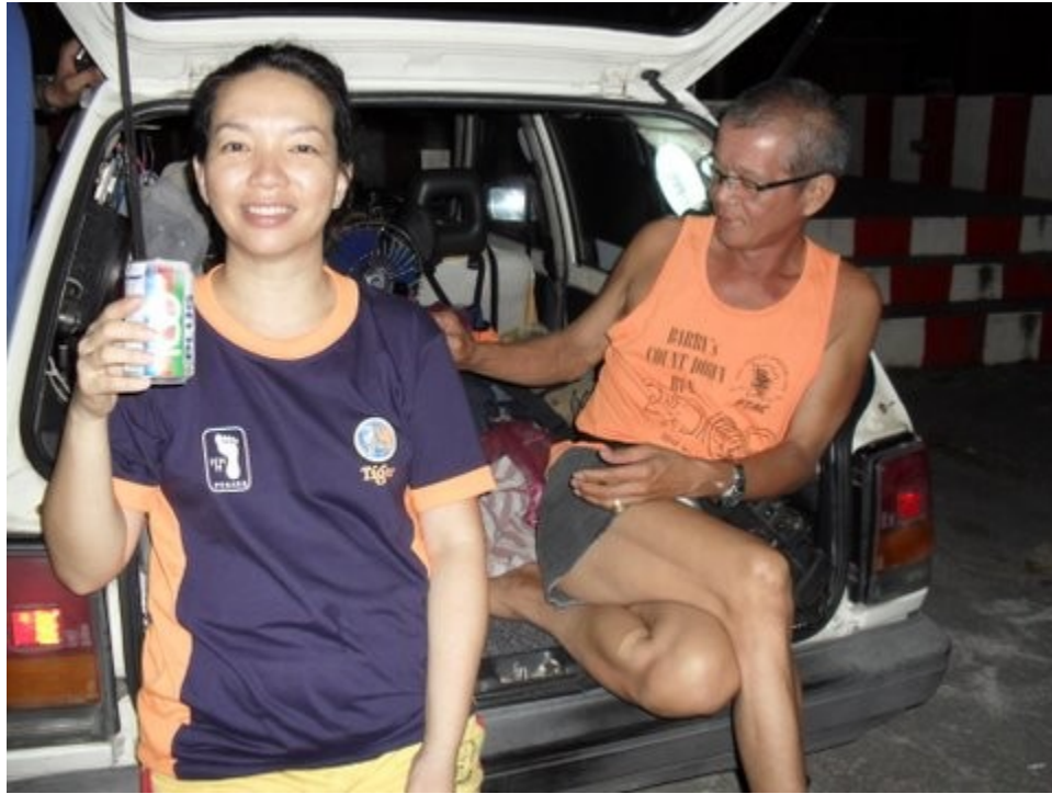
So were G-String and Take Care