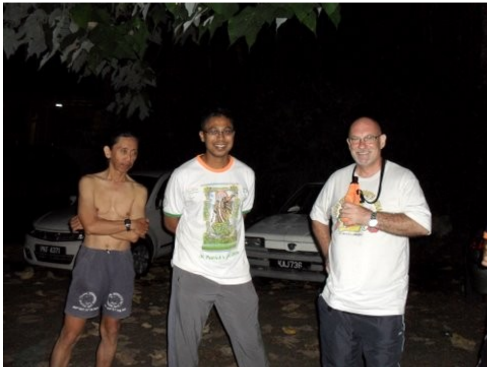
The 3 M's