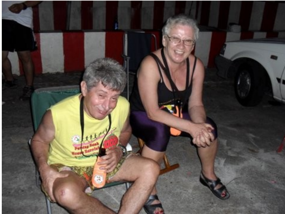
Fancy Pants and Fancy Panties enjoying the evening.