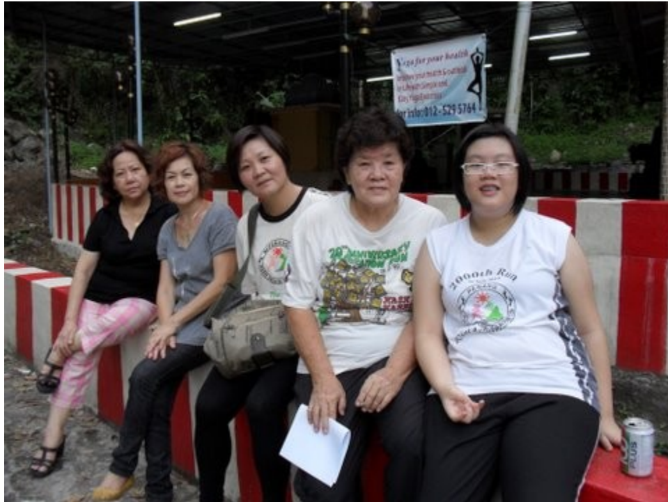
The glamour girls