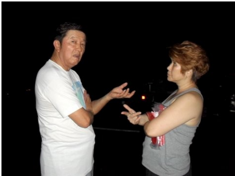
Nice to see you back TT.