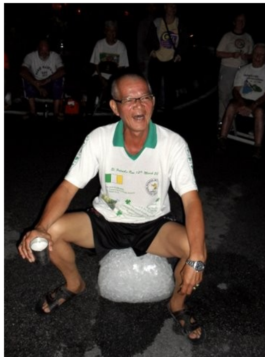
Take Care was his usual disruptive self