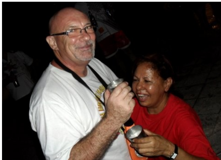
Co-hares on ice!!