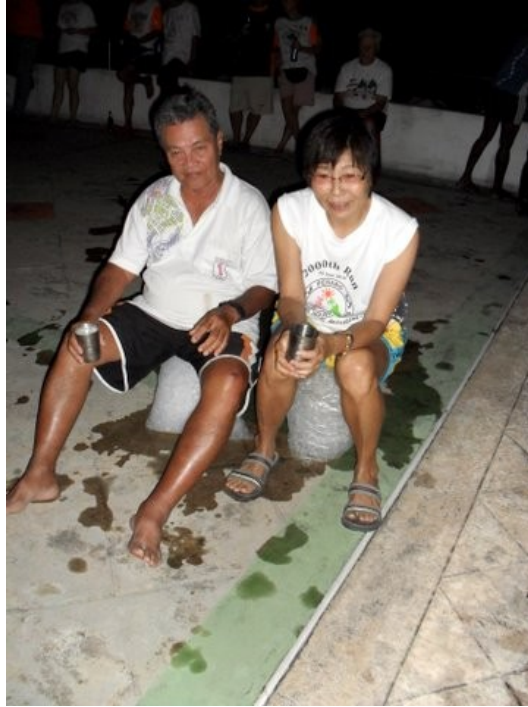
Roast Pork gourmets. Very Tasty!