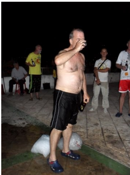
After receiving his "sperming"