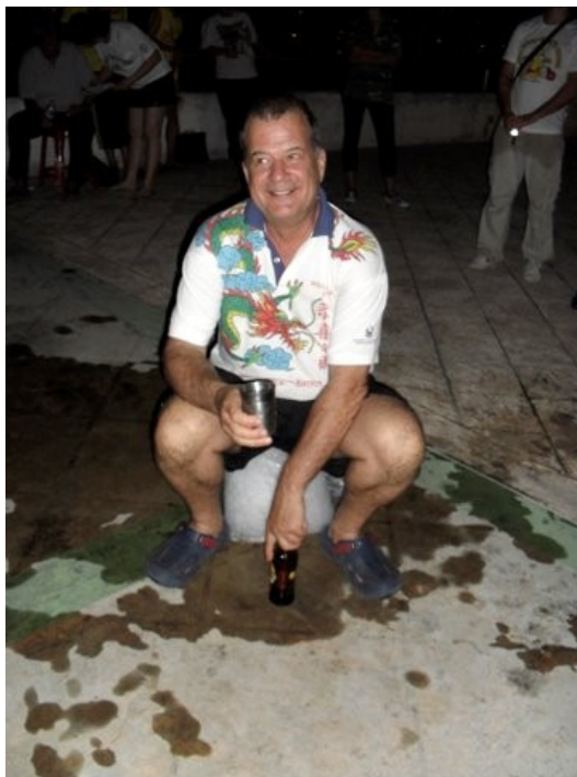
Before: Spermwhale listening to his accuser