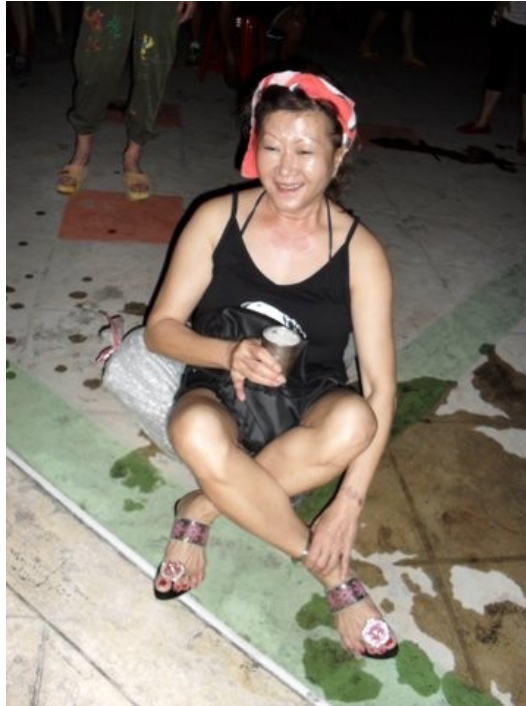
'Arranger par excellence'