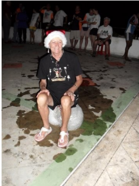
Didn't know you were Greek (salad) Gracie! Delicious