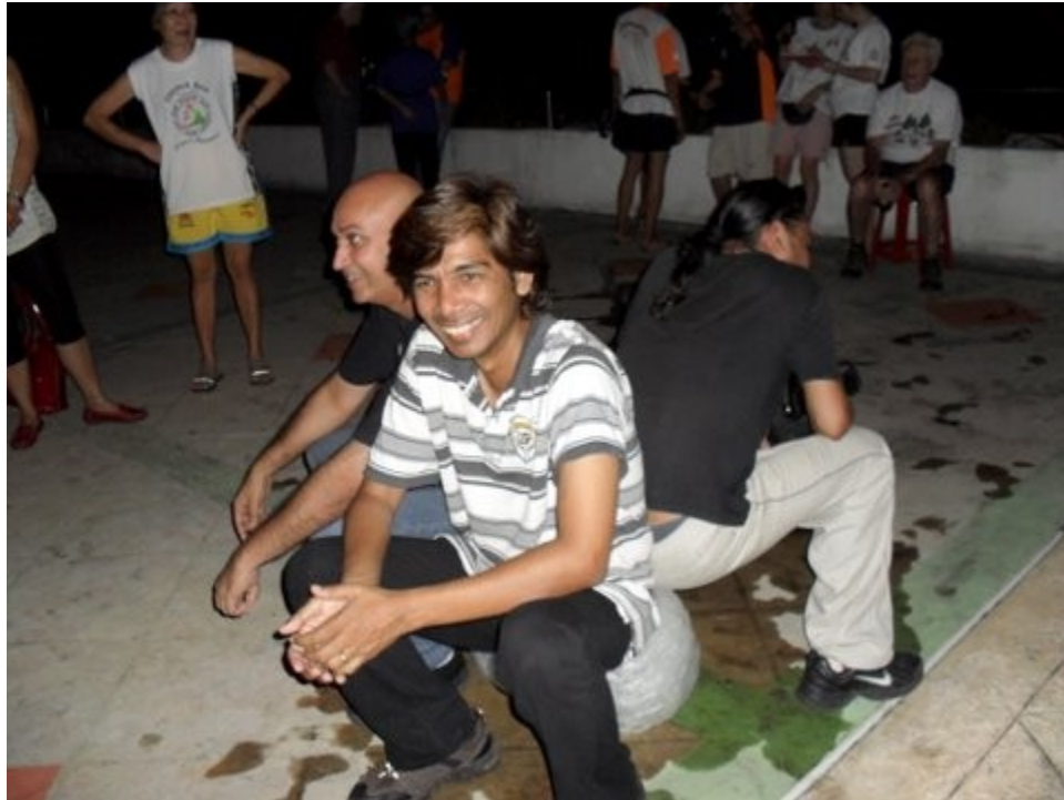
DJ Maestros – Thanks a million guys