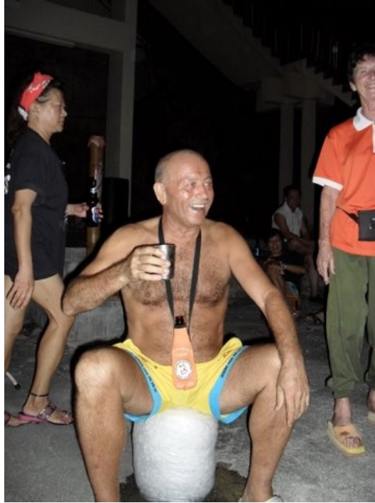
The new 'Rambo' style for Money!!