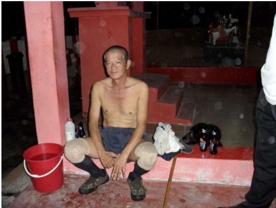
Take Care about to have his luxury bath!