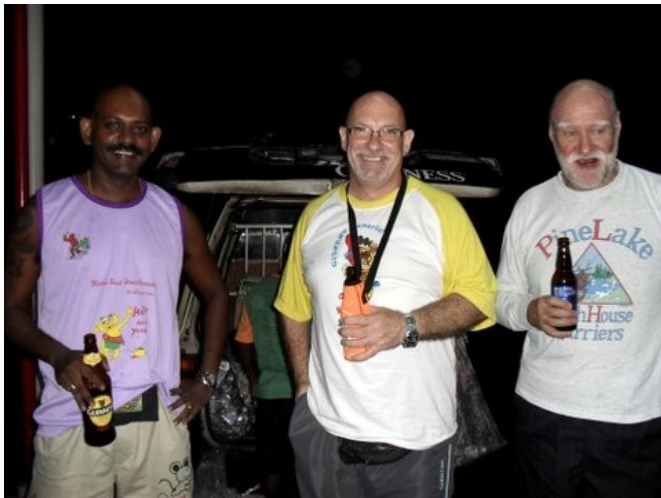
Ebony and Ivory 2