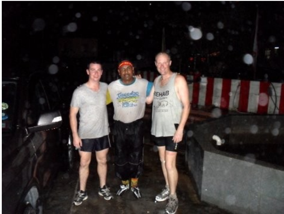
The only 3 (out of 8) to complete the whole run! Well done guys!!