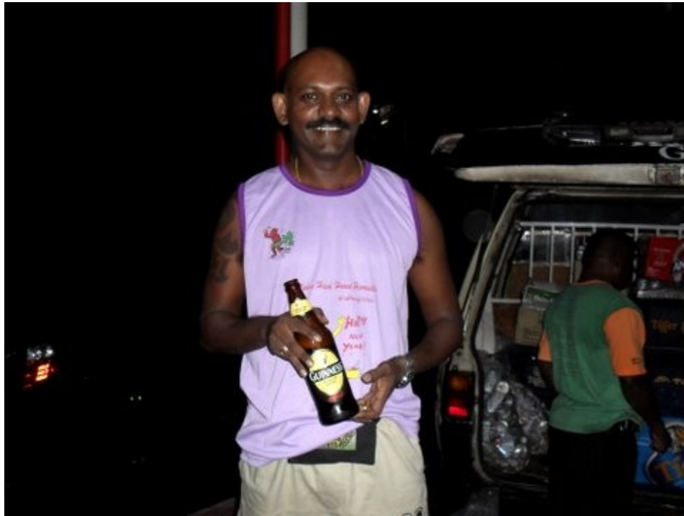
Grasshopper showing off his big one