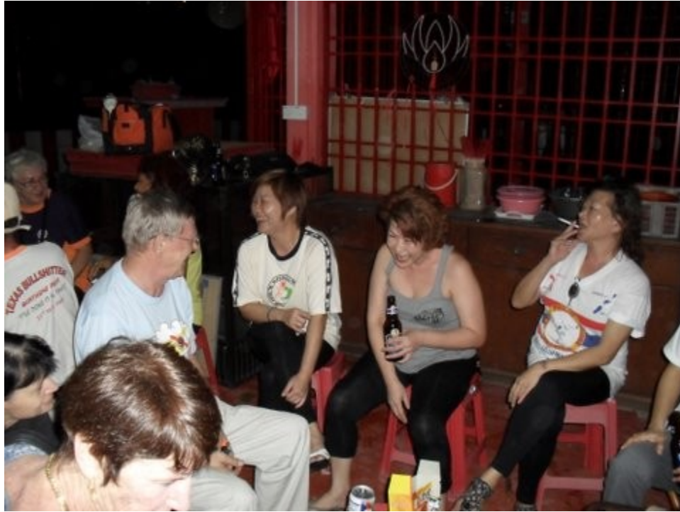
As must have been this one!!