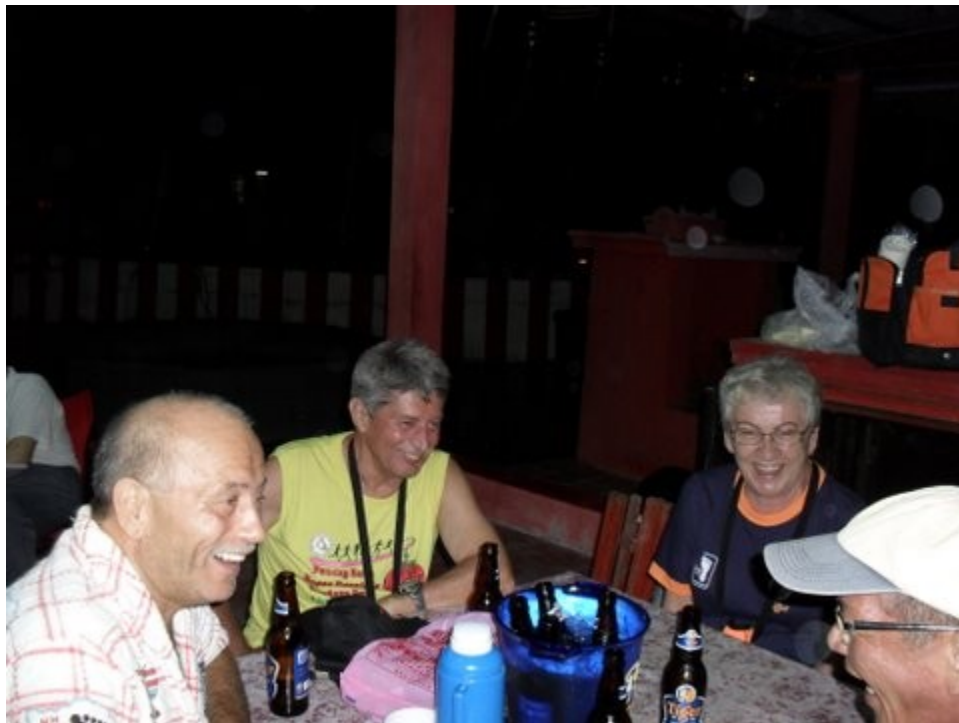
It must have been a good one!!