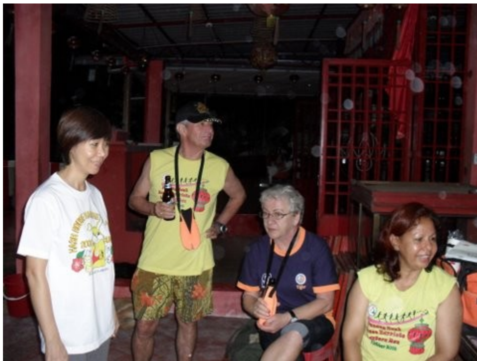
Fancy Pants looking satisfied now that he's got the Amber nectar