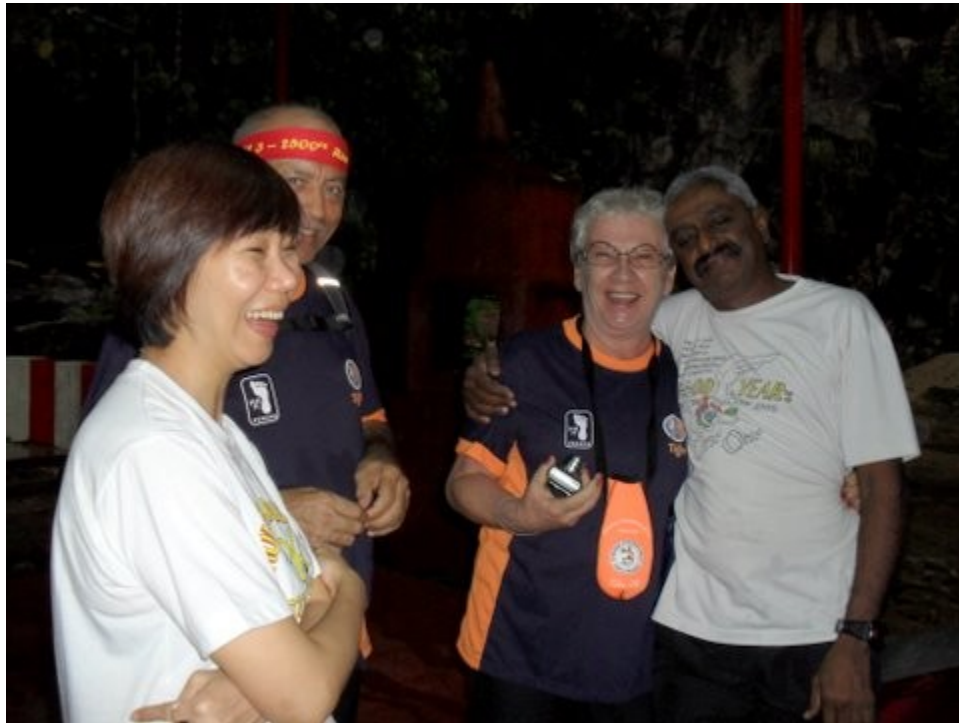
All friends together!!