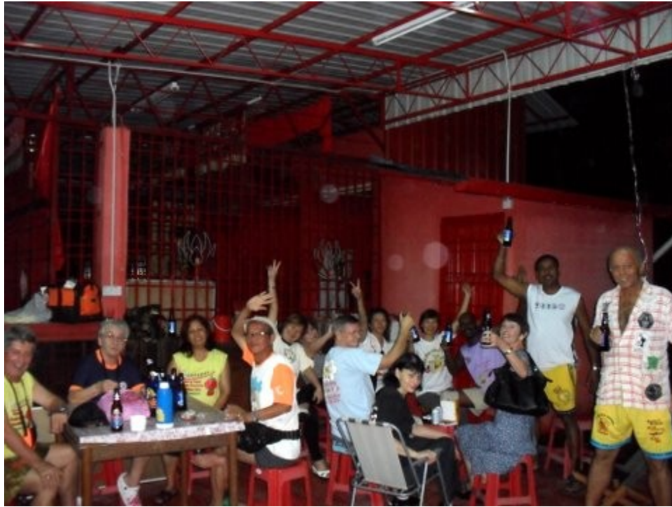
We're having a jolly good time