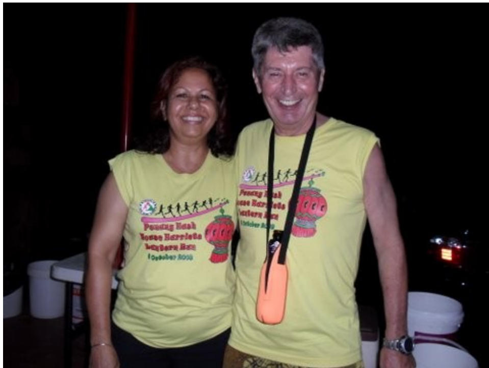
SNAP – The On Sex and Hare of the Day