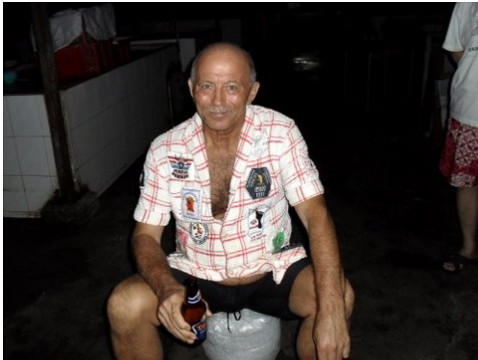
A spurious charge saw Money Manfred on ice!