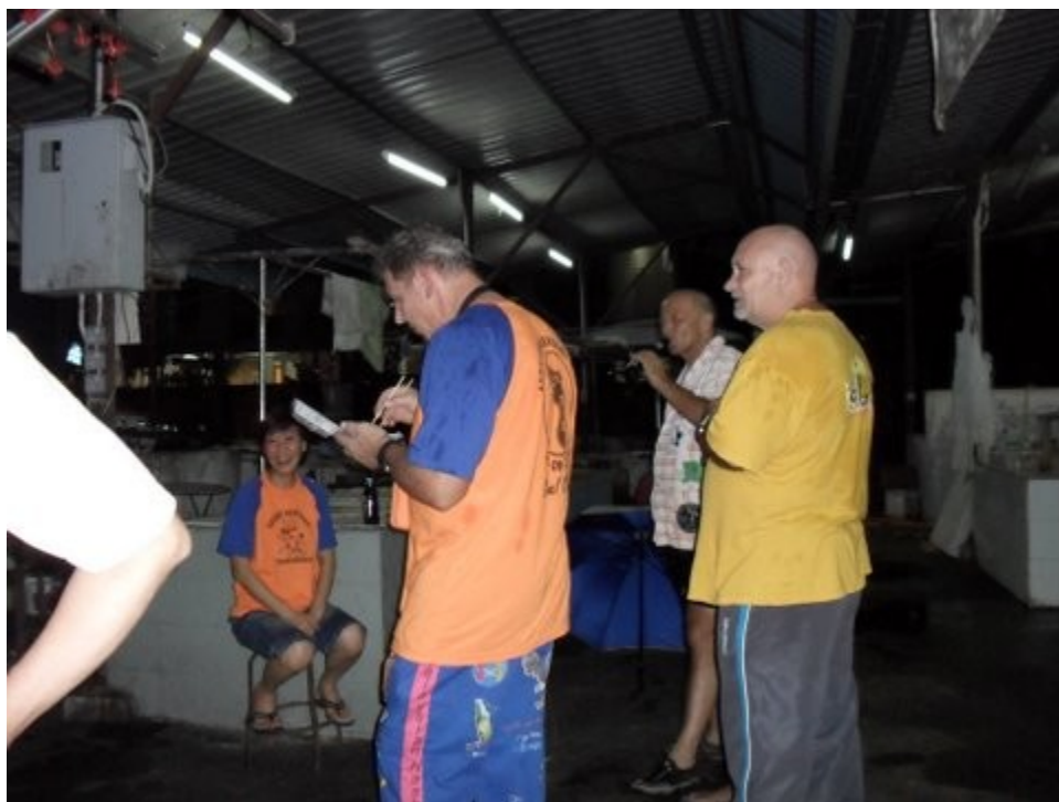
We come in all shapes and sizes...Some BIG size too!