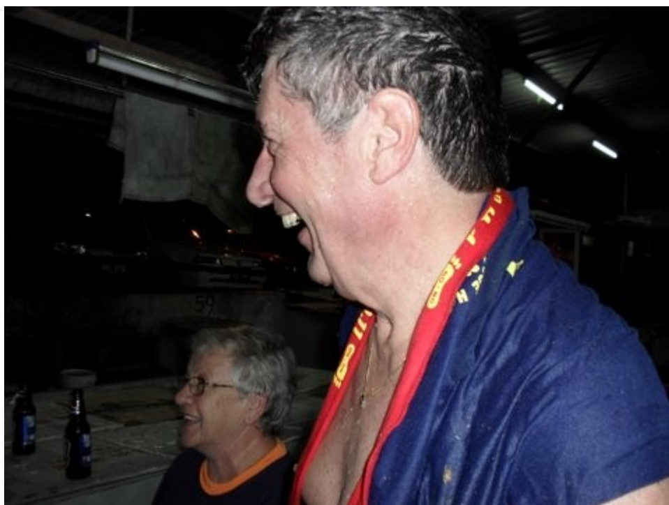
While Fancy Pants enjoys the telling!