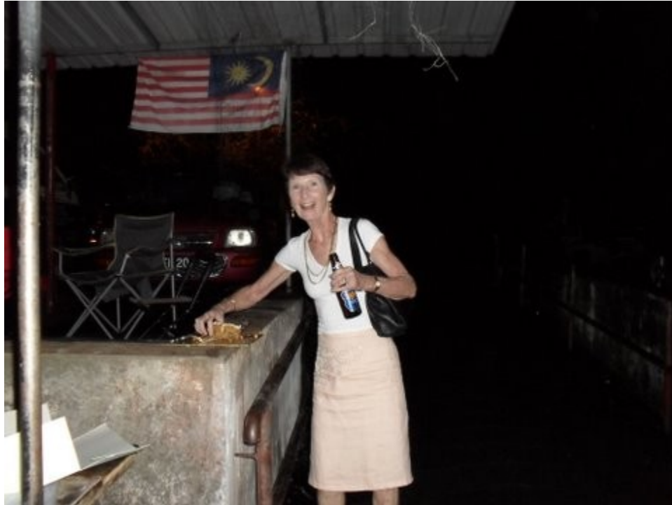
'So am I" says the GM No hash shirt though!!!!