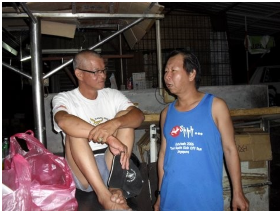
The Co-hares wondering if they will need to go back in!