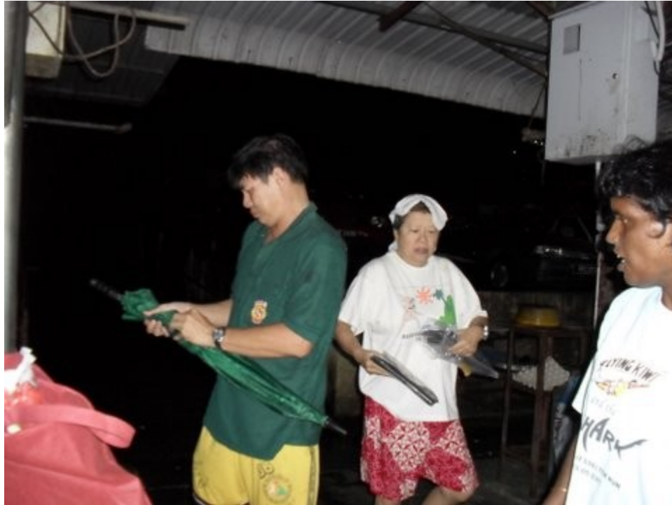
Silent Man has come well equipped!!