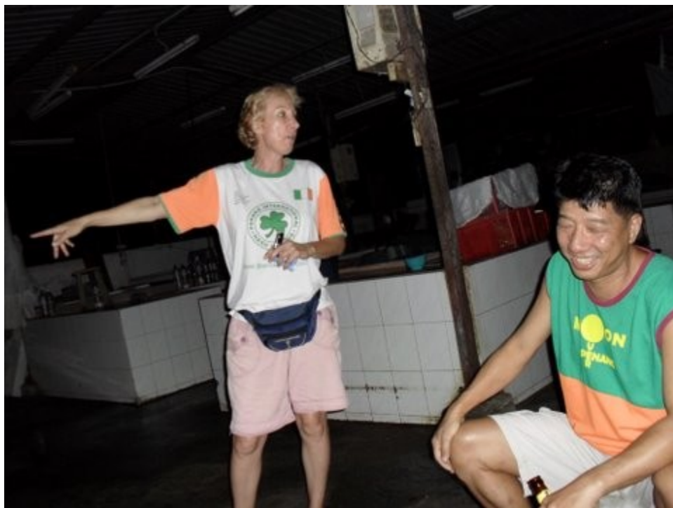
But Bibi Tulips set the record straight!!