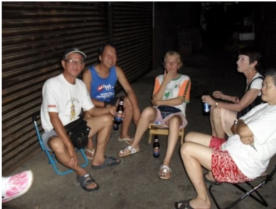
Whiling the night away in good company!!!