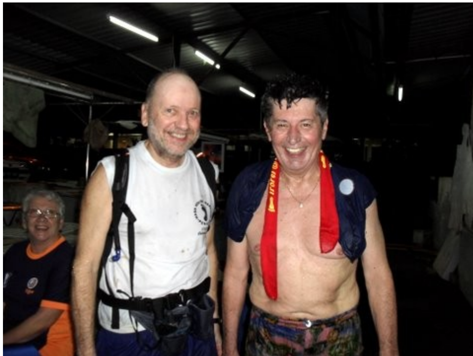
They both had an eventful run and were one of the last out!! Alls well that ends well!!