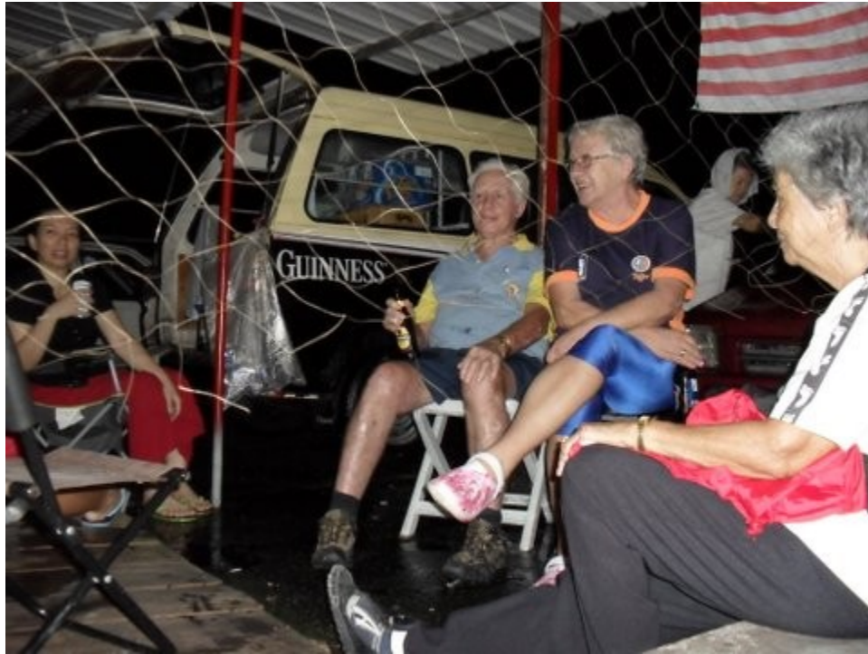
Some of our members are so wild we keep them behind netting!!