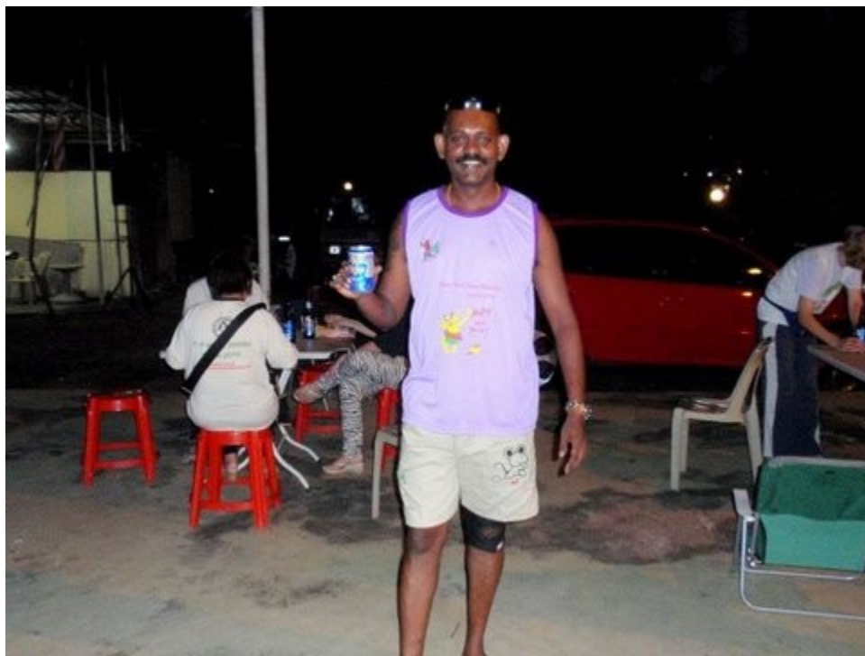
Grasshopper was having a super time!