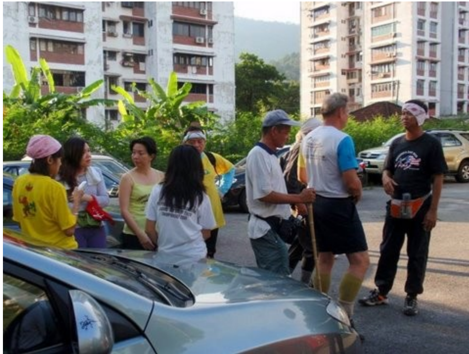
Fancy Dress and Fancier Hats!!