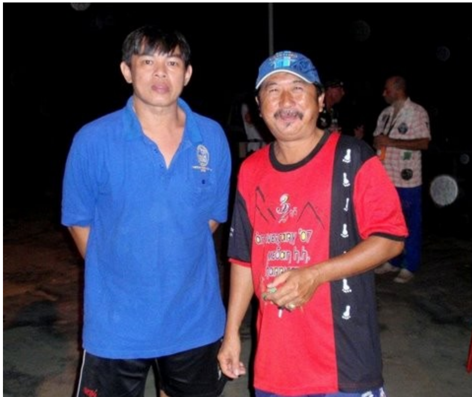
What's that in RED? My goodness it's a BUSY BODY. A very rare sighting these days!!