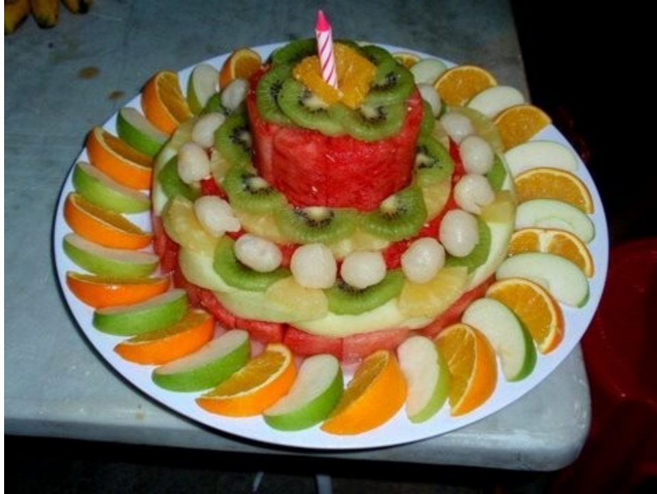
The fruit cake was fantastic!