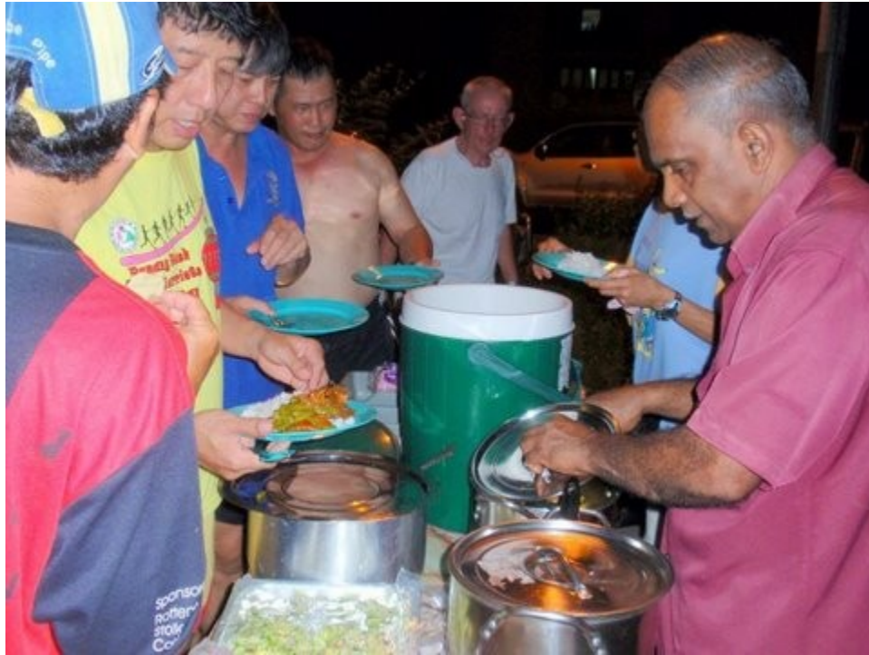
Delicious and plentiful!!