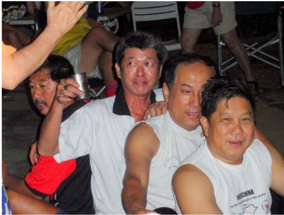
Good supporters but hardly run nowadays since all are too busy lah!!