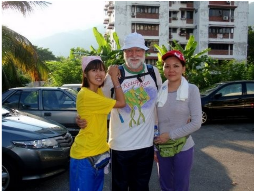
Beauties and the Beast!!