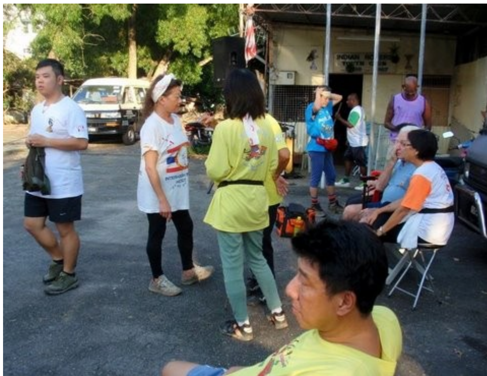
Saving energy ready for the big push!!