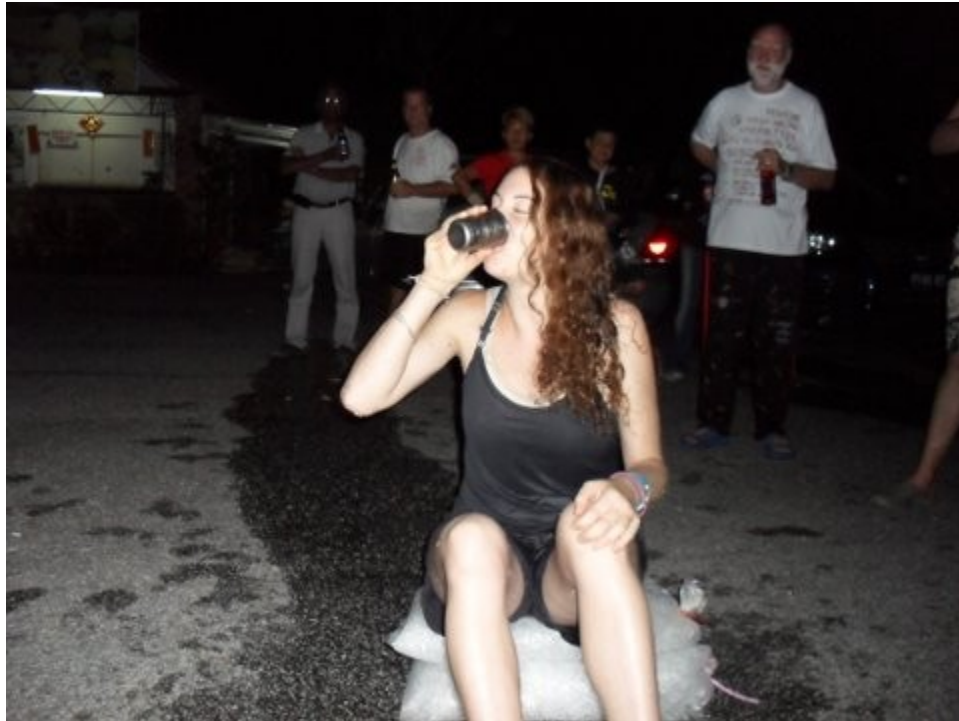
Just checking the Back Door