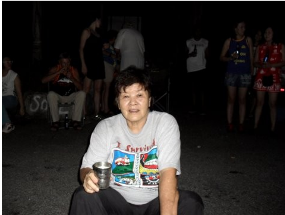
A belated icing as thanks for your run