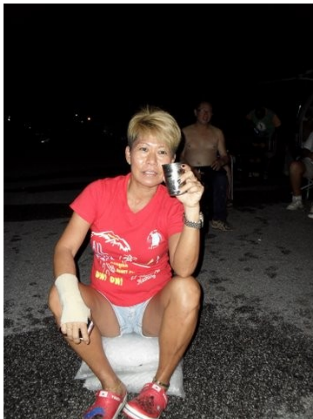
It's great to get all your Medan friends at our run. Thanks