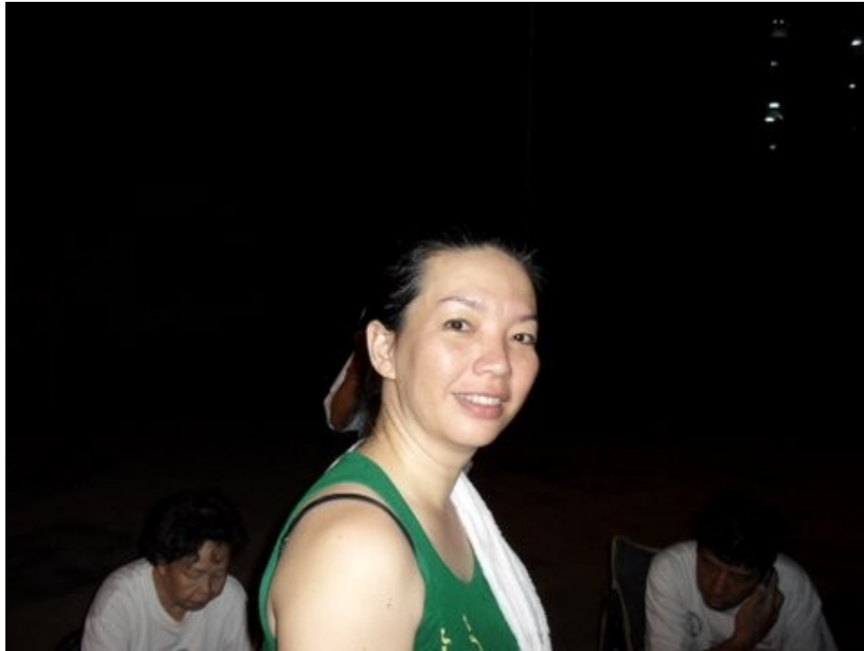
Our On Cash!!