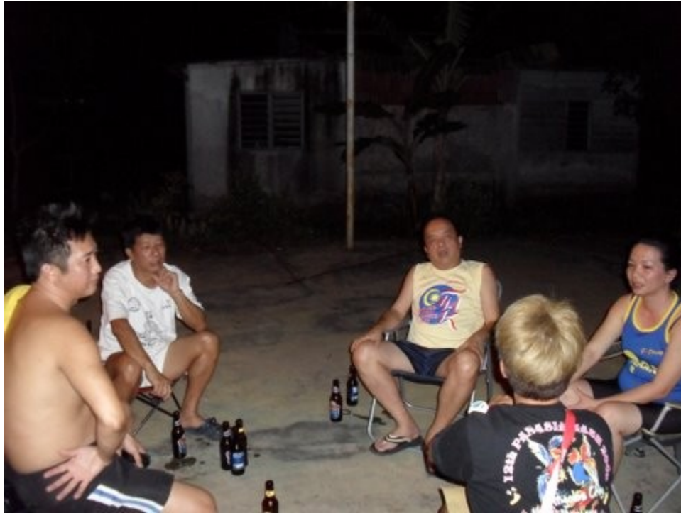
So nice to chill out with friends and sink a few cold Tigers after a run!