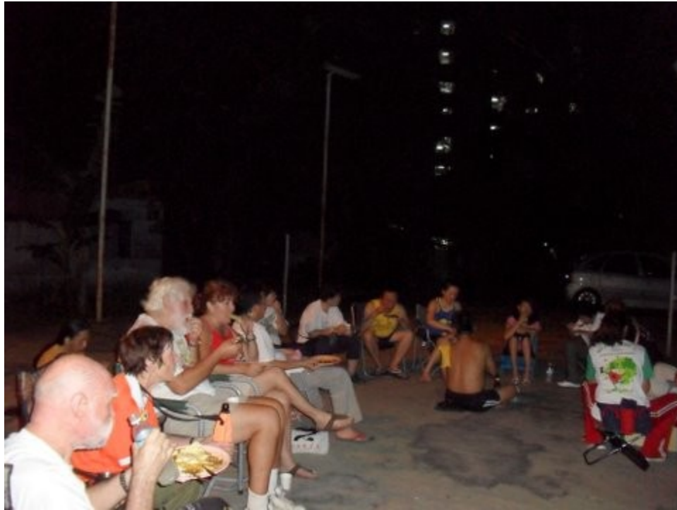
All the little ducks in a row!!