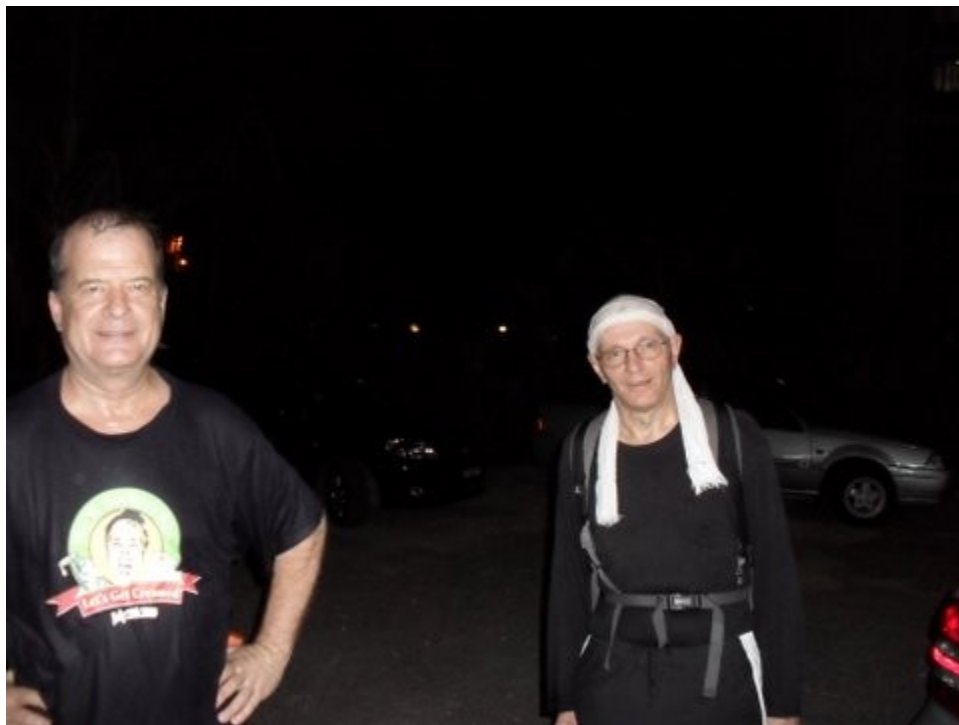
Sperm Whale and the General found the run too short and hence were late back since they extended their run!