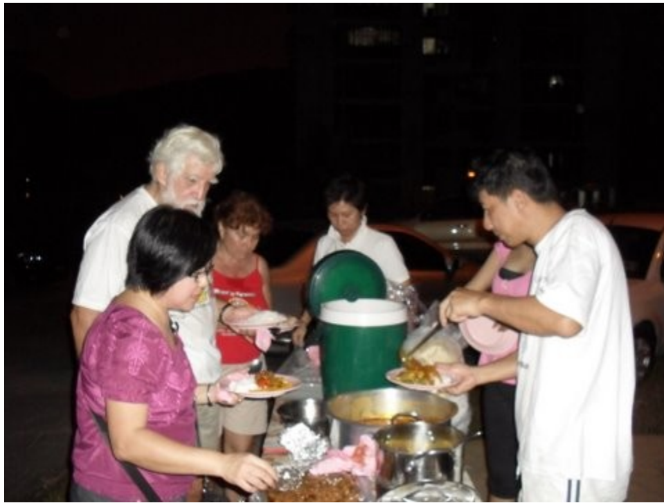
"Food, glorious food"