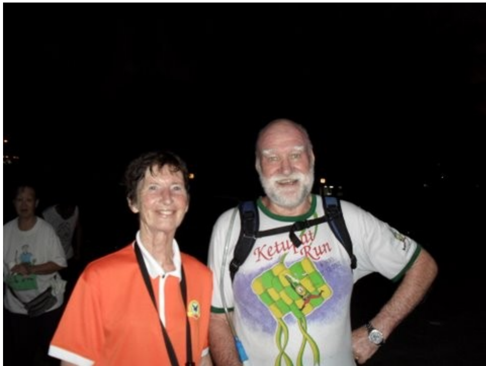
Nice to see the GM and Huge back after their vacation.