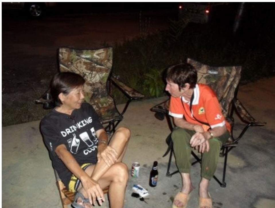
The GM catching up on the latest news