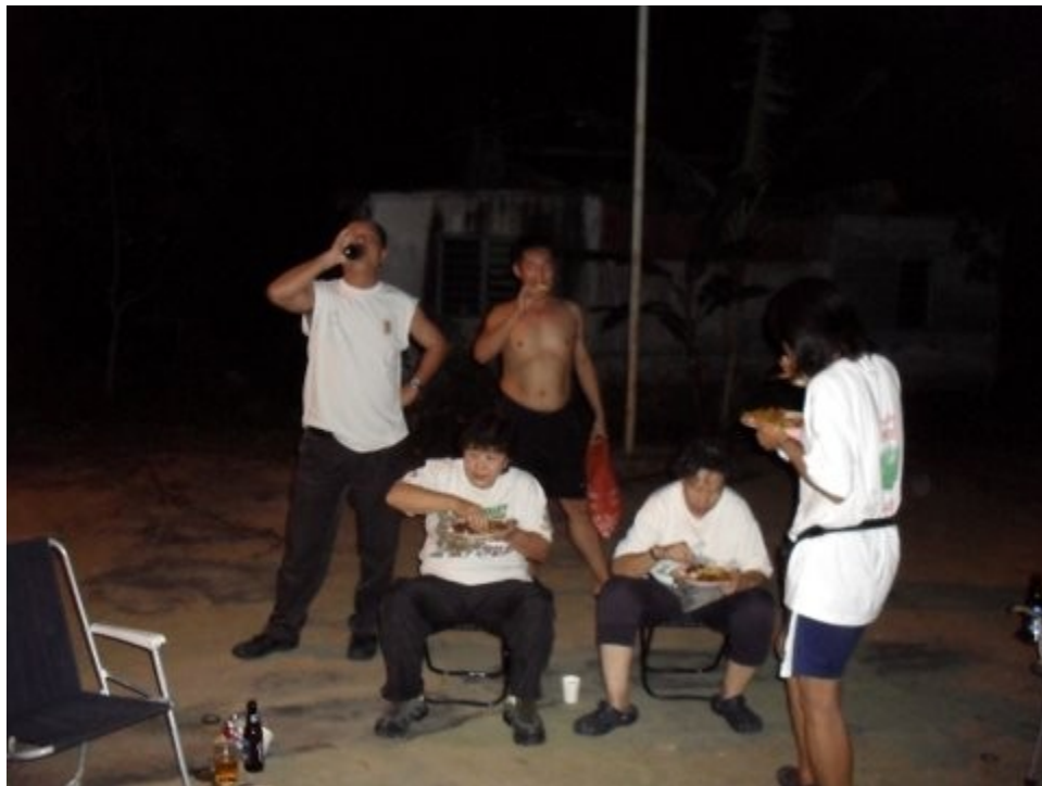
Getting it down!!