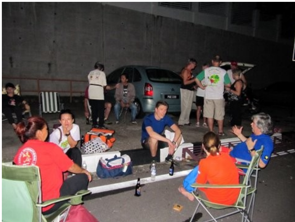
Taking a breather and a refreshing Tiger. Nothing better!!