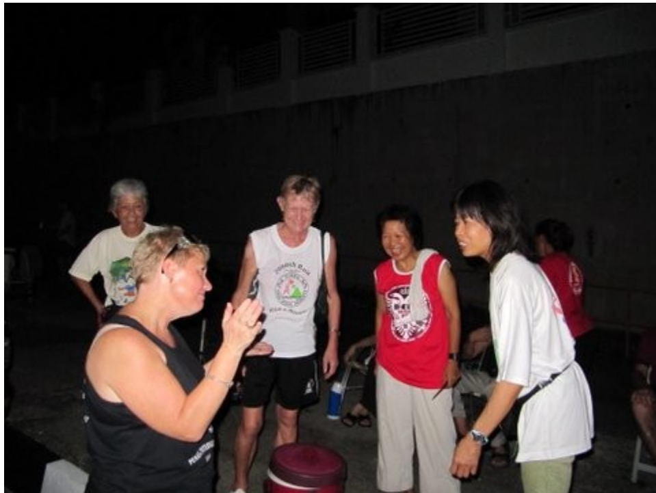
A new ladies choir??