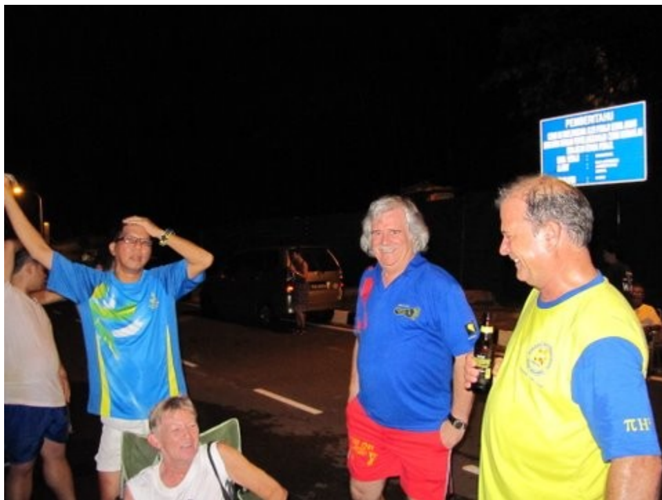
A colourful bunch!!