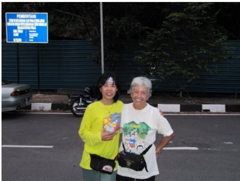
What lovely smiles!!