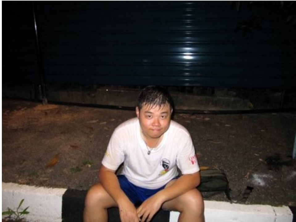
Not the Godfather just the Godson!!