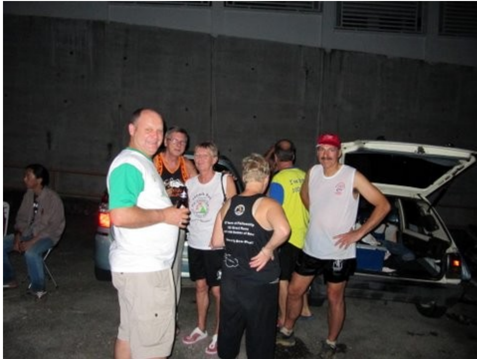
Looking like you've never been away Gangreen!!