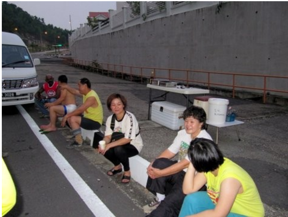
Queuing for makan already!