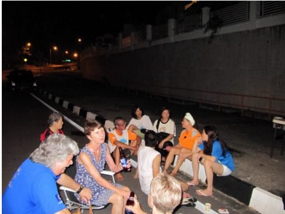
Still waiting the return of the lost!