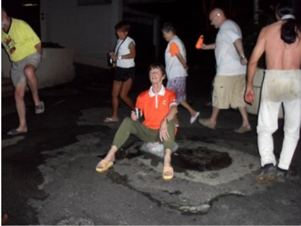
GM again on ice from a charge by Akz Hole of attending two runs in a row!!