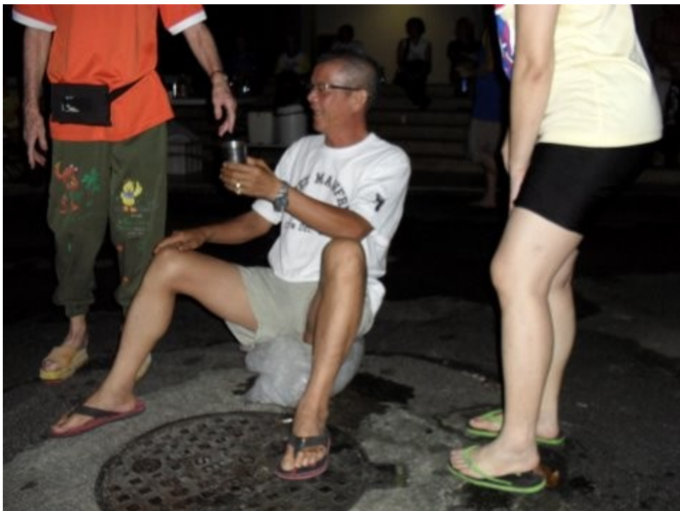
Take Care can never keep quiet at Circle time