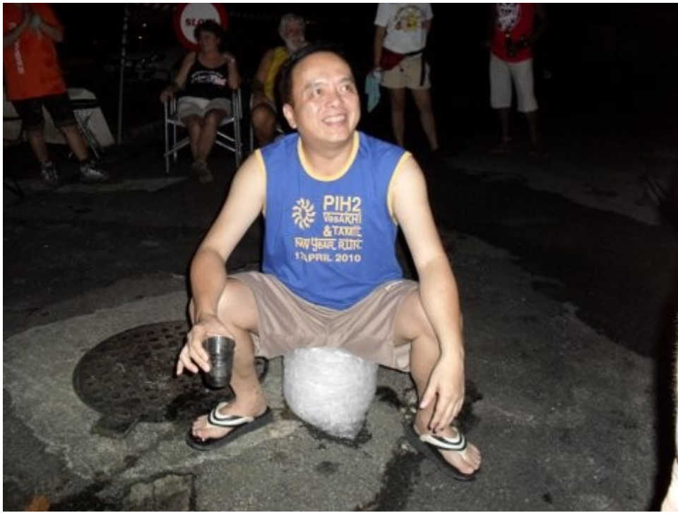
The always smiling and ever helpful Bend Over