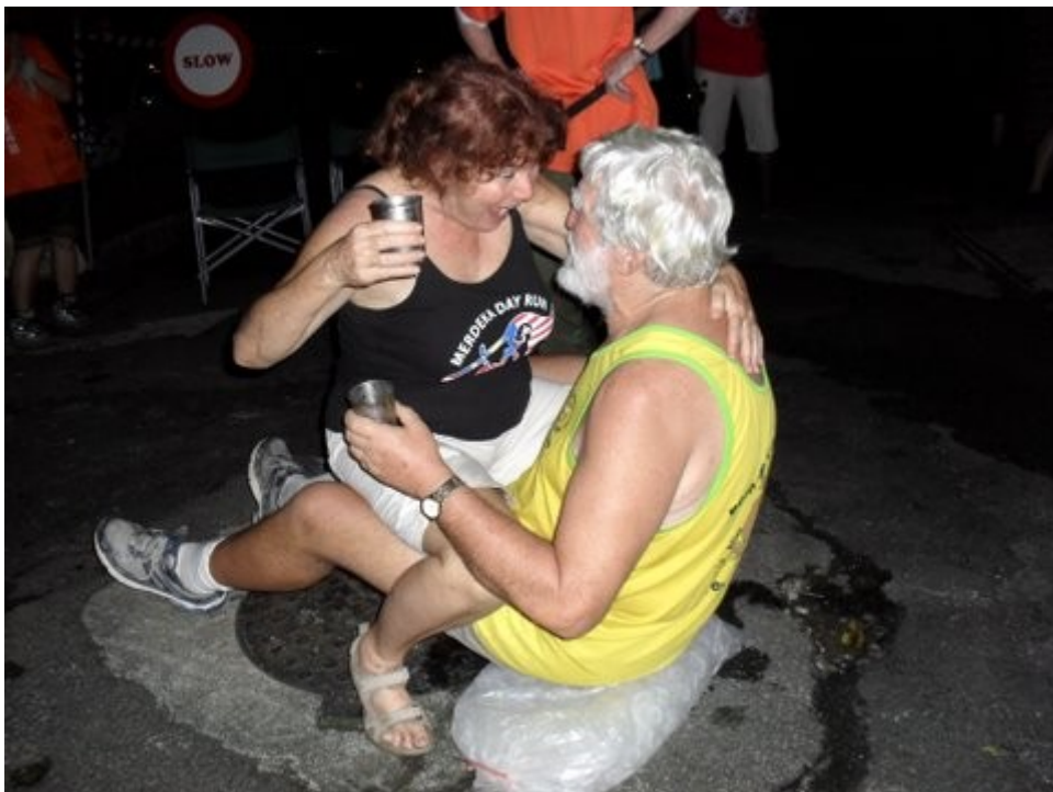
Bon Voyage. Have a great time.