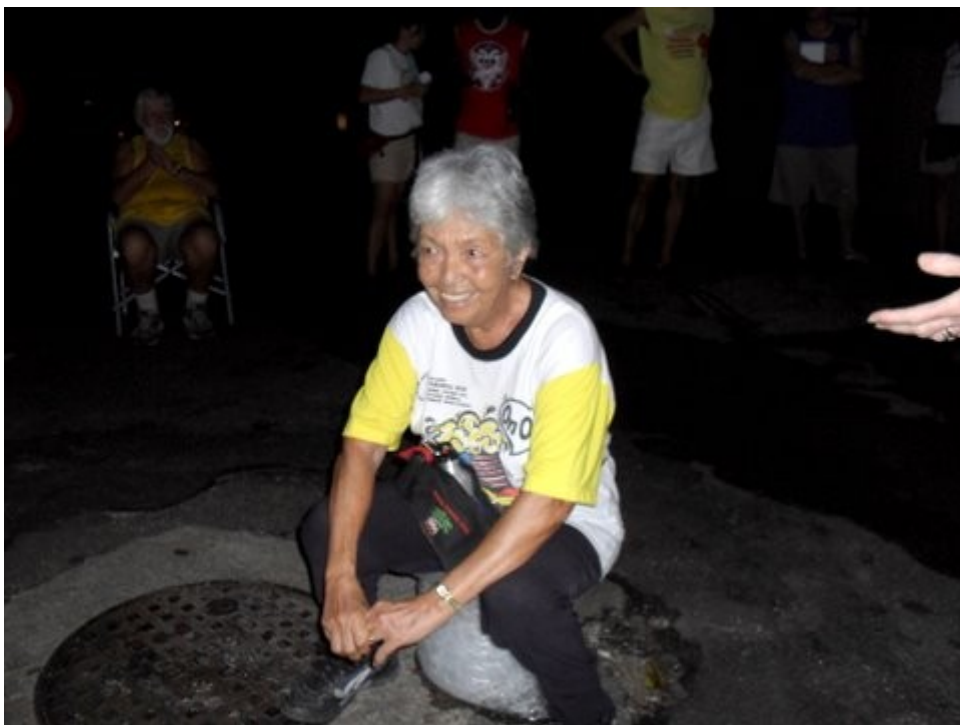
Happy Birthday Grandma