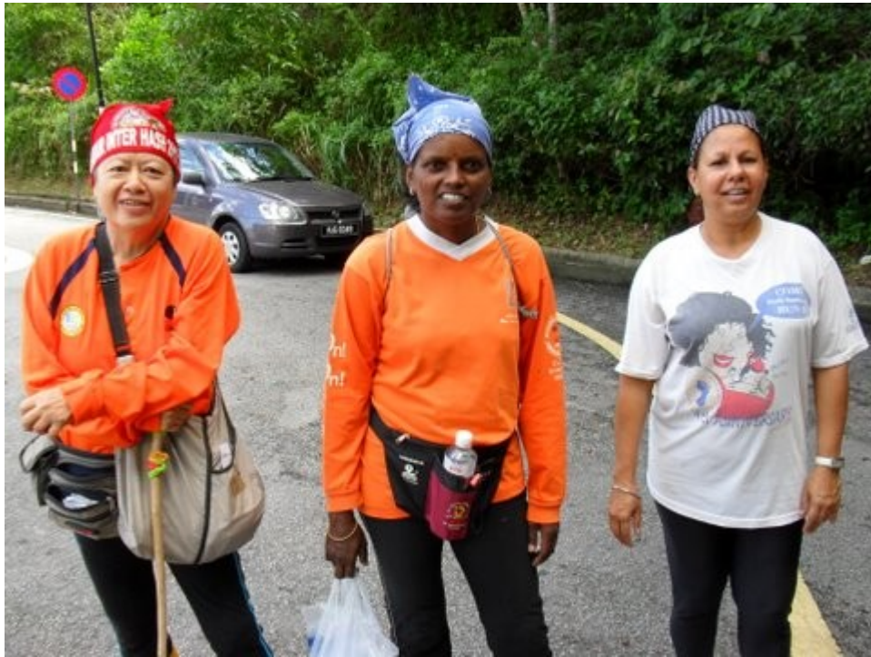
The other co-hares.