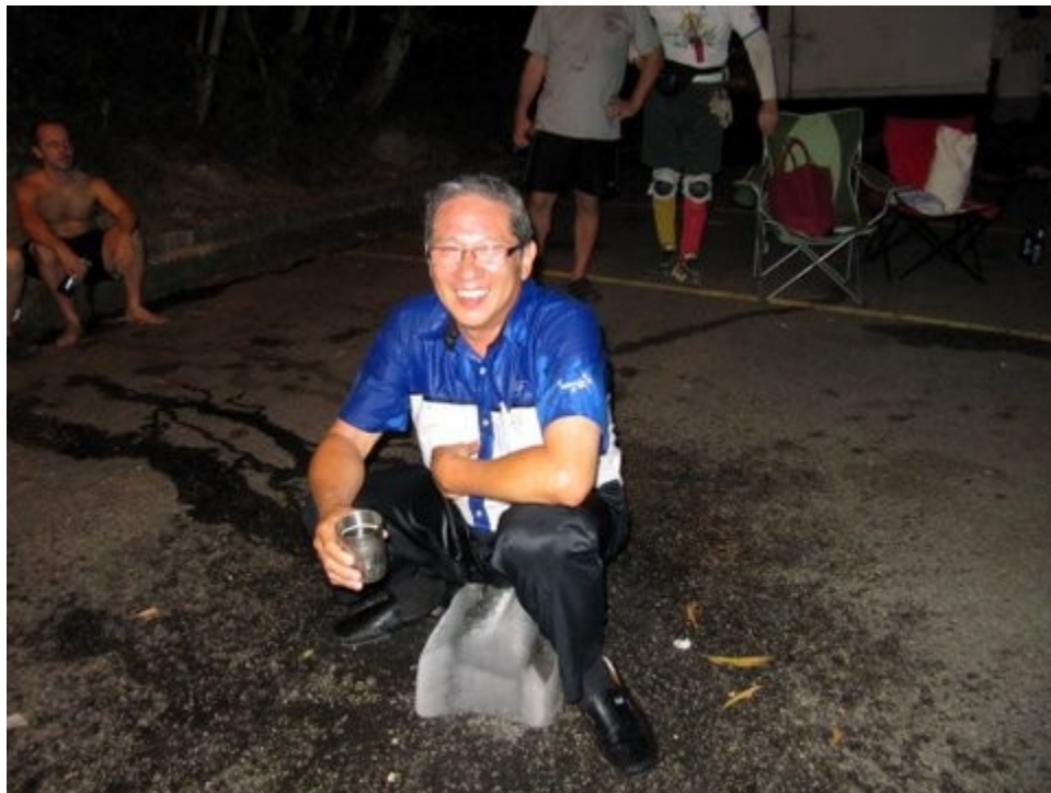
After But still smiling!!!