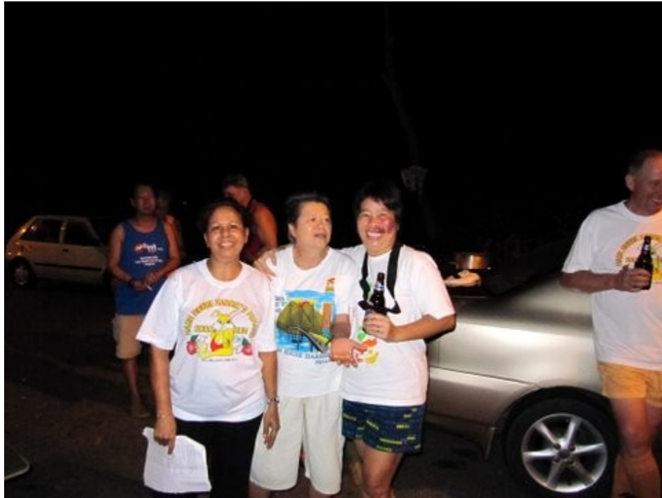
The New Choir!!!!