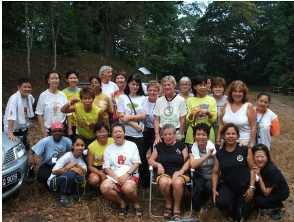
The voting members!!!!!!

Please, if you have any ideas for the newsletter or comments to make, let me have them. All ideas are welcome and it helps to make the newsletter more interesting. After all it is YOUR newsletter and YOUR Club.