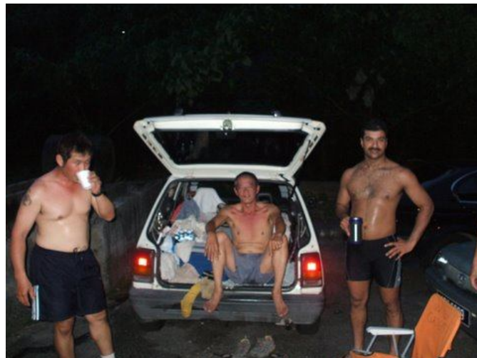
The Views: One is breathtaking, the other breast taking!!!!!!!!!!!!!!