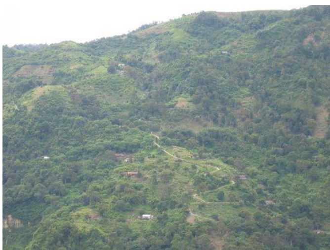
Some more of the breathtaking type of scenery!!