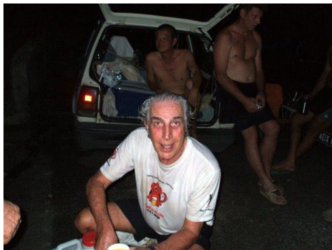
Welcome back White Lion!!!