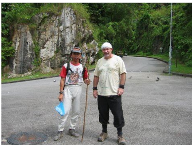
The hare and co-hares. What a sight!!!!!!!!!!