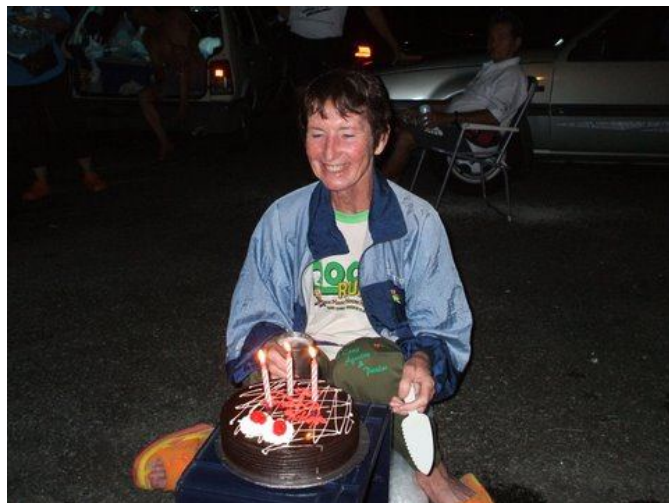
Happy Birthday GM!!!