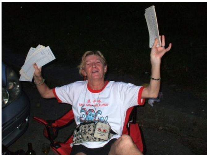
Ah!! The power of the card holder!!